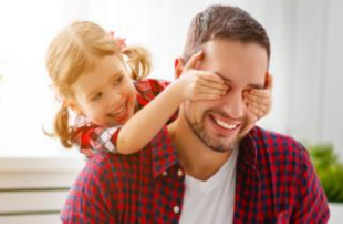
Legal and Immigration